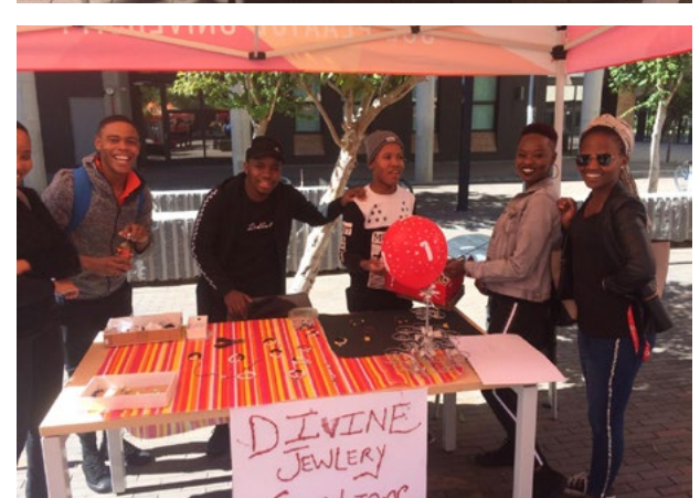
SPU entrepreneurs get down to business.